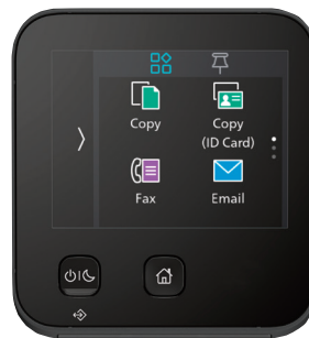
2.8-inch colour touch panel